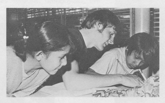
Breaking barriers through education

The grant from the Department of Health, Education and Welfare, is one of the largest