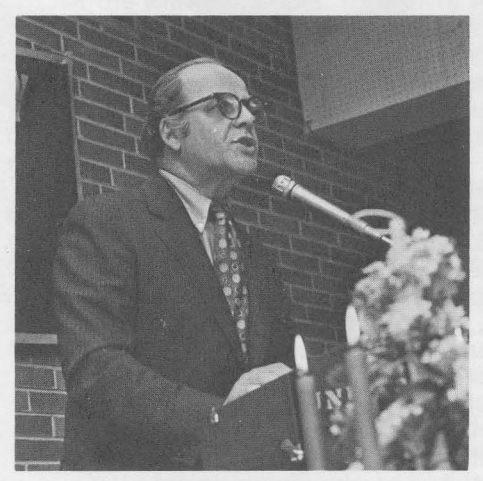
Guest Speaker Senator Gaylord Nelson . . . In Defense of Earth

It was the start of a new tradition that evening, when an overflow crowd of nearly 300 people gathered at the University Center on March 17 for the first annual College of Natural Resources Recognition Banquet.