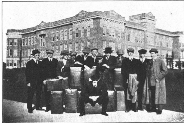
The above view was taken in front of the Normal School building at LaCrosse. The team's good nature had not as yet been marred by the game.