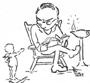
A GREAT ANNOYANCE to Students

Weekly meetings are held on Tuesday evenings at 7:15 o'clock. The programs consist of debates, orations, parliamentary practice, current event reports, readings and musical numbers.