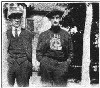
Our Grand Rapids Friends