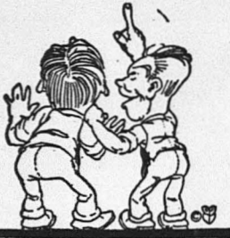
Our Teachers At Milwaukee

Forty-eight hours of vacation will be ours next Wednesday at 4 p. m. when the professors of C. S. T. C. hie themselves to Milwaukee for the annual Wisconsin Teachers Convention. The conclave will last three days, November 1st to 3rd inclusive, during which time the pro-