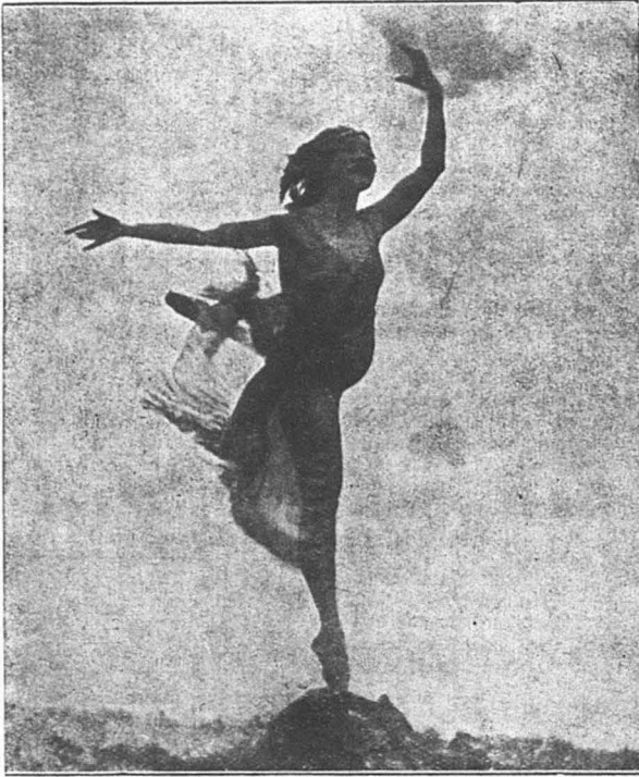
Iris de Luce