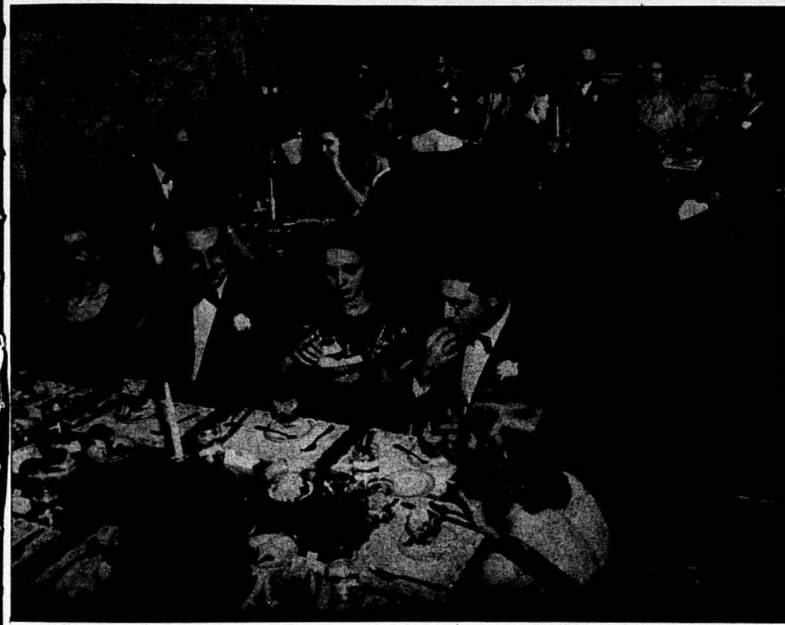
So intent upon the "business at hand" that they are totally oblivious of the camera are shown a group of Omegas, their escorts and special guests. Scene of this picture is the dining room of the Sunrise where the Omega Mu Chi formal dinner was held on Saturday evening, January 17.