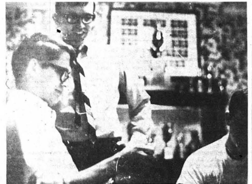
CARD PLAYING is one of the favorite activities at the Sigma Tau Gamma house at 1727 Jefferson St.