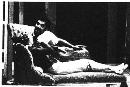
Dracula complete with fangs and a devilish thirst appears on the Summer Theatre Stage

Many legends exist about the "curse" of Dracula. The researchers said there was "something there" at the castle but they were hesitant to be more specific in spite of the fact they themselves ran into several bits of exceedingly bad luck while investigating it. They found a portrait of Dracula, in a chamber of horrors collected by a Tyrolean Prince in 1591. His grave was found in a monastery near Bucharest, and since his burial, the monastery reportedly has had many misfortunes. It was empty except for a few prehistoric animal bones, and it might be that, as the researchers thought the monks had moved the body, which had been buried too close to the altar, for a man with Dracula's reputation.