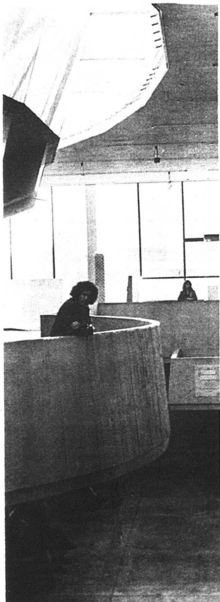
The Fine Arts Center seems to be a fine place to hang around.