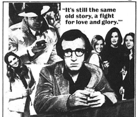
"It's still the same old story, a fight for love and glory."