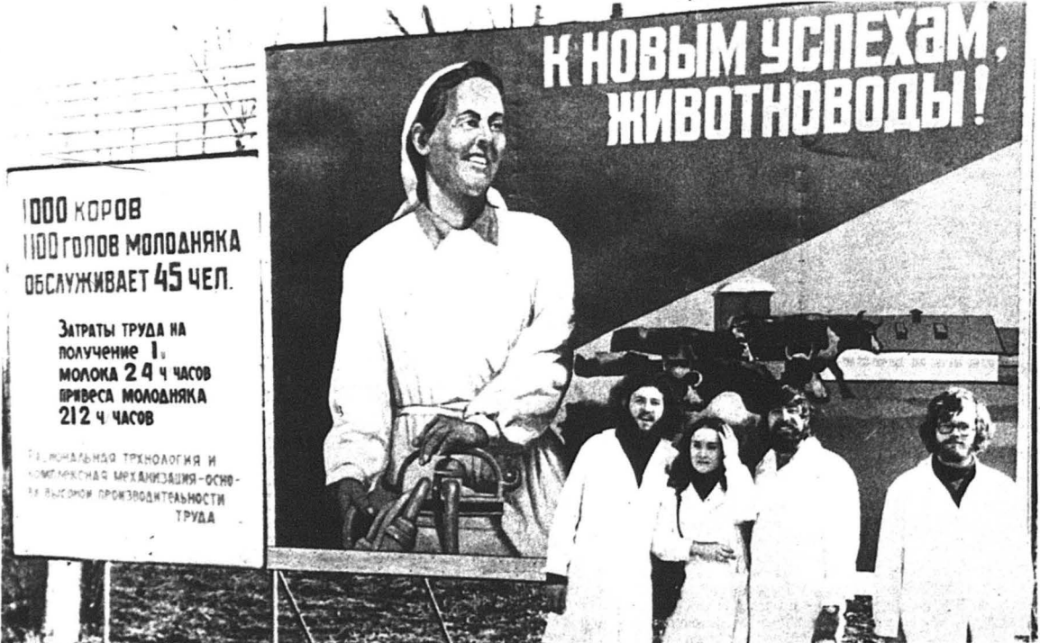
A poster showing a woman utilizing a milking machine is displayed at the entrance of a state-owned dairy farm near Kharkov in the Soviet Union.