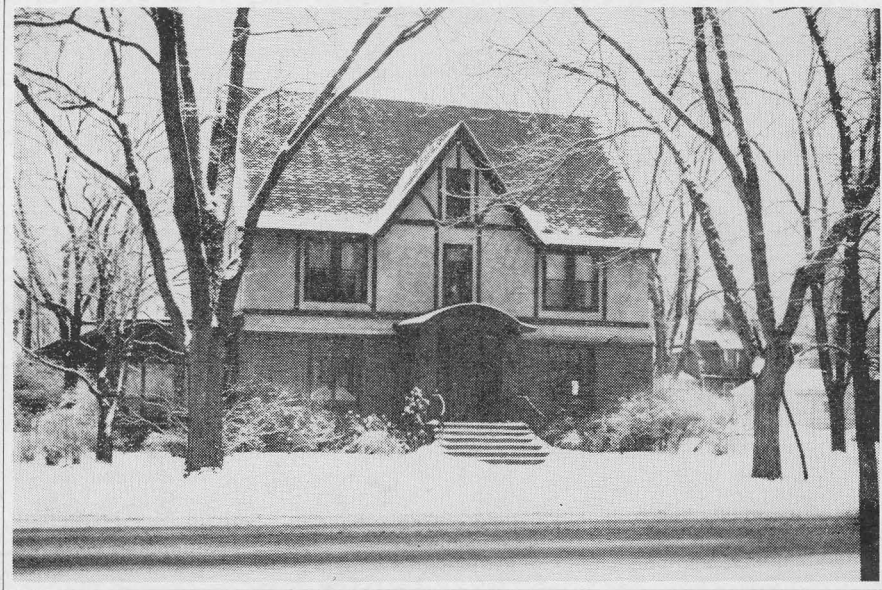
THE HOME MANAGEMENT HOUSE 1103 Main Street CENTRAL WISCONSIN STATE COLLEGE Stevens Point, Wisconsin

Alumni News Bulletin Alumni Association Central Wisconsin State College Stevens Point, Wisconsin