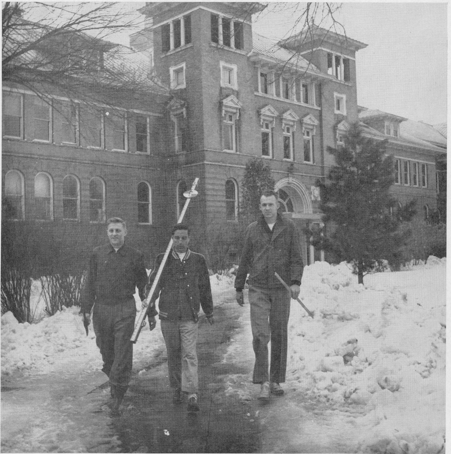
Conservation Students At Central Wisconsin State College