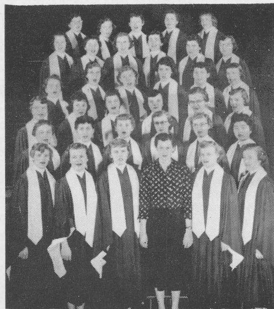
The Girls Glee Club Wisconsin State College Stevens Point, Wisconsin