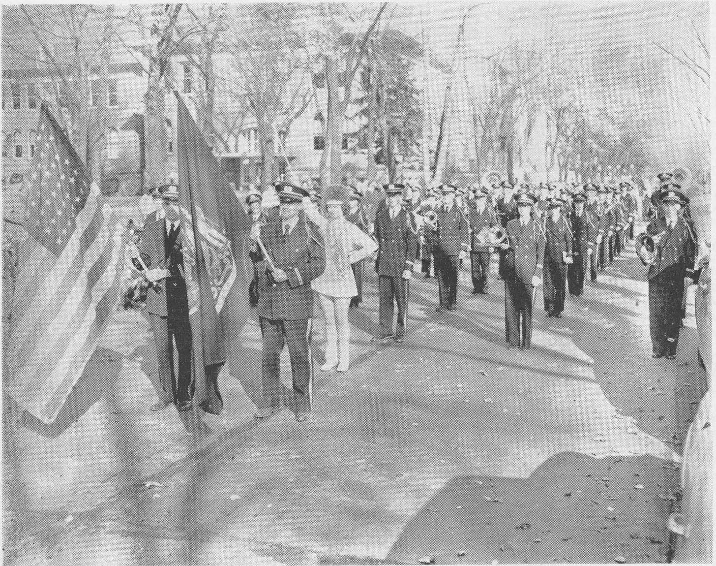
The College Band Wisconsin State College — Stevens Point, Wisconsin