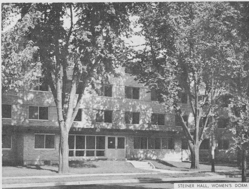
STEINER HALL, WOMEN'S DORM