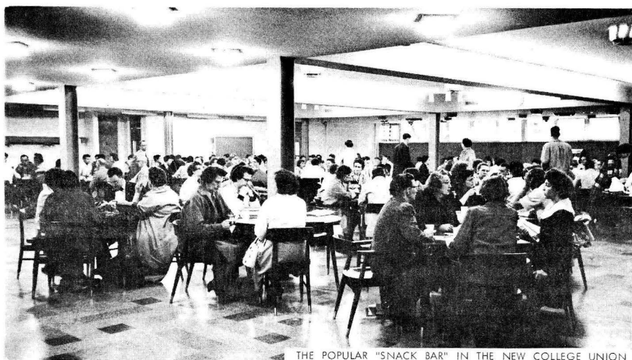
THE POPULAR "SNACK BAR" IN THE NEW COLLEGE UNION

July 17 - 19 the History Department in cooperation with the Service Center for Teachers of History of the American Historical Association held an institute for high school teachers of history. All sessions of the institute were held at the College Union, except for one public lecture in the auditorium. The subject of the conference was "American Foreign Policy, Retrospect and Prospect." Twenty-two teachers of high schools located throughout the state participated in the institute. Three visiting historians, nationally recognized as experts in the field of diplomacy, participated as leaders in the institute. They were Professor Wayne Cole of Iowa State University, Professor Alexander DeConde of the University of Michigan, and Professor William A. Williams of the University of Wisconsin. All members of the History Department of Stevens Point participated in the leadership of the conference.