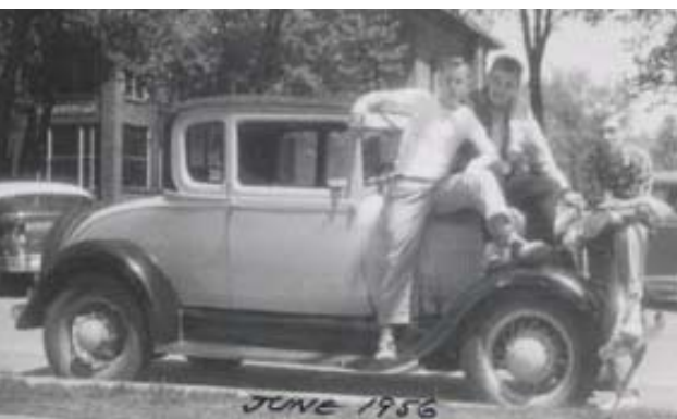
Nelson Hall Memories p.16