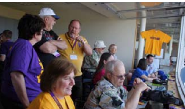
Alumni Reunions p. 7