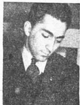
Hardworking and ever loyal CSTC Booster